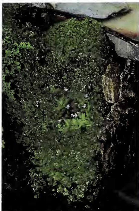
Figure 3. Full-view of the microhabitat where P. crystallina subsp. hirtiflora is cultivated in the Botanical Garden of Calabria University.